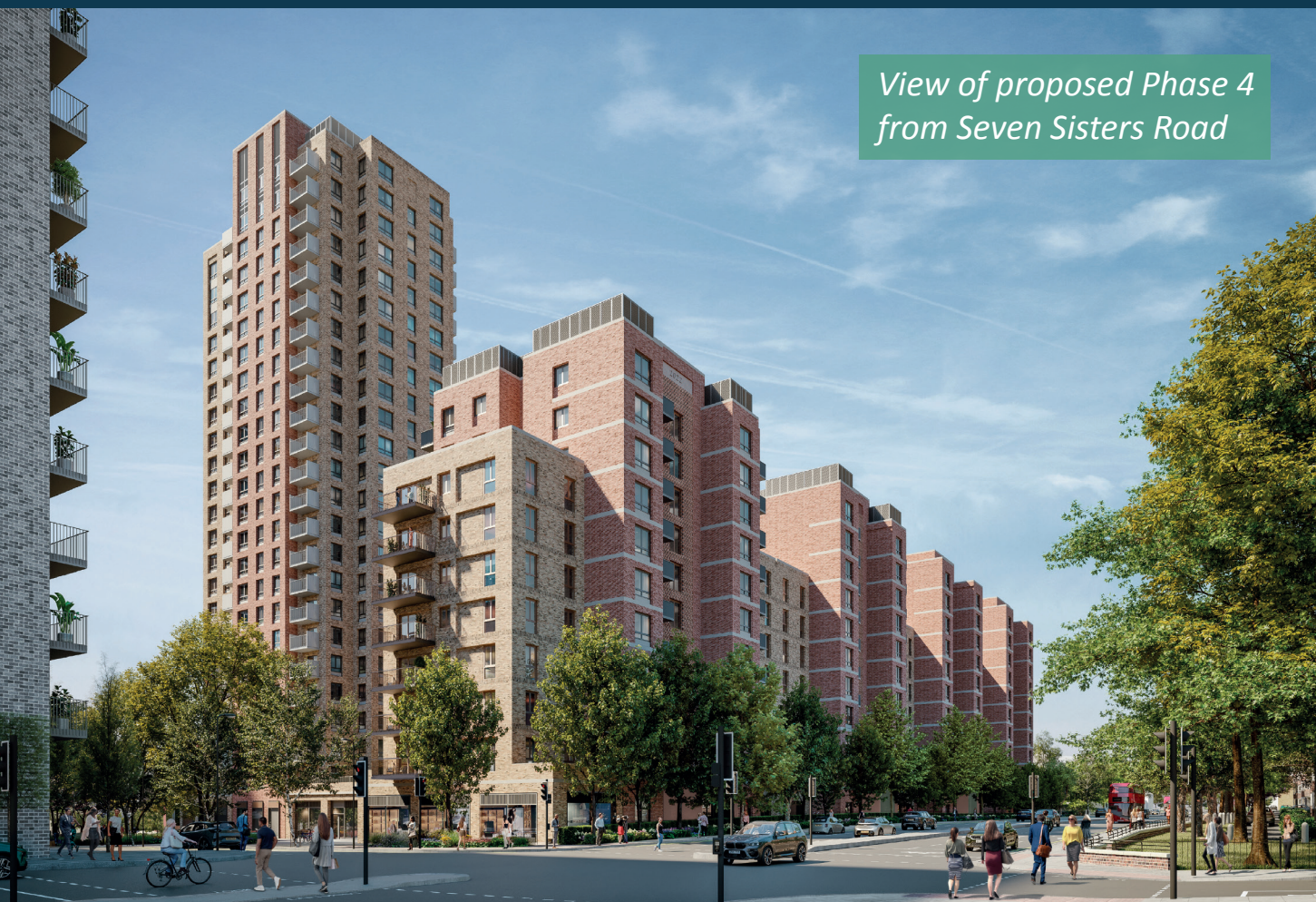
View of proposed Phase 4 from Seven Sisters Road