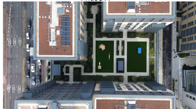
Block A Podium