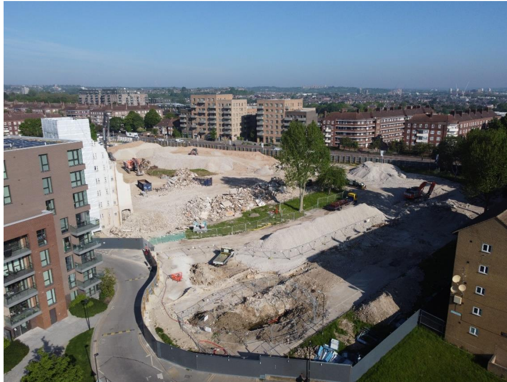
Burtonwood House demolition nearing completion