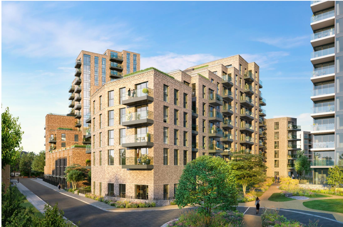
CGI view from Spring Park Drive