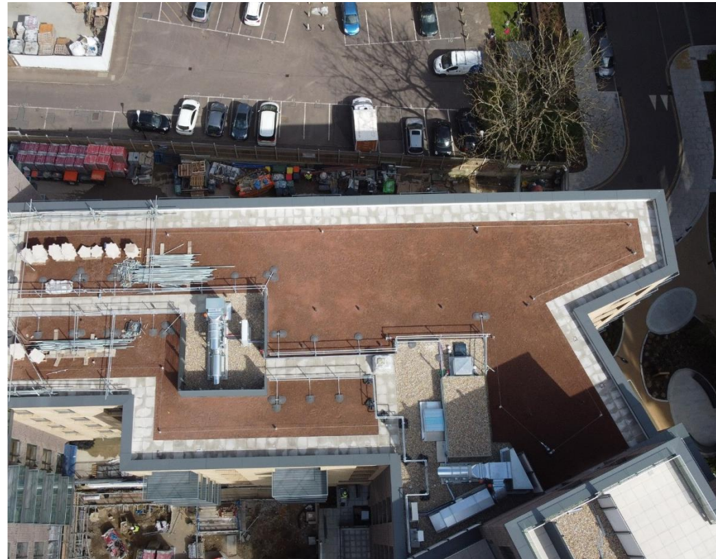
Core B3 roof works nearing completion