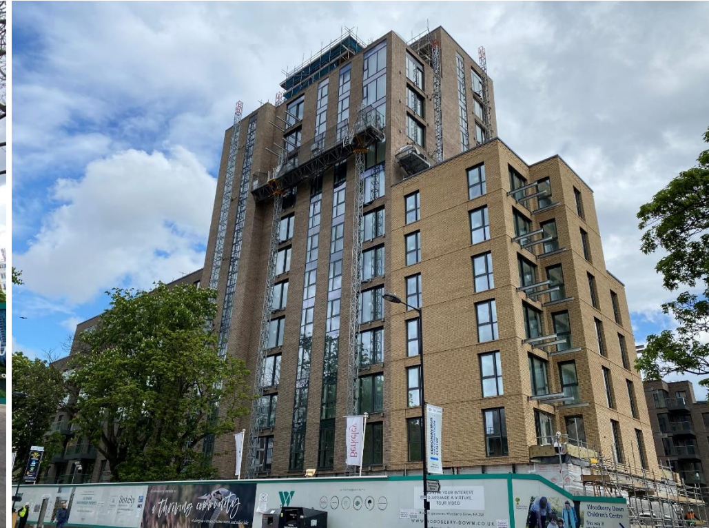
Landscaping between Blocks B and D now complete with wayfinding signage