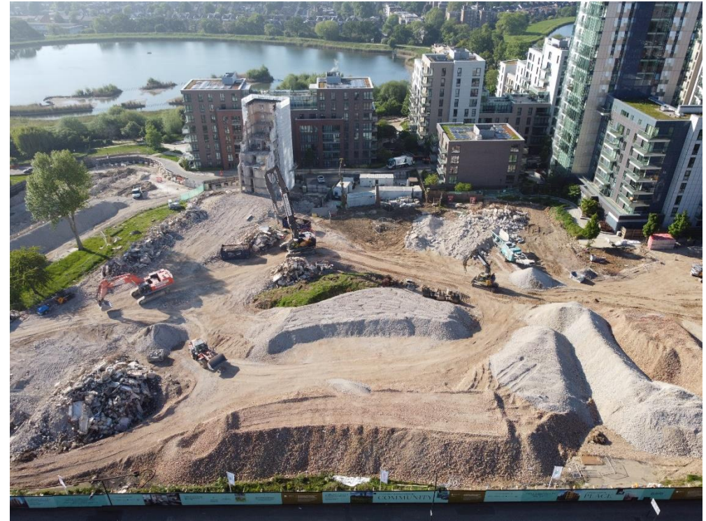
Piles of crush waiting to be re-used on site