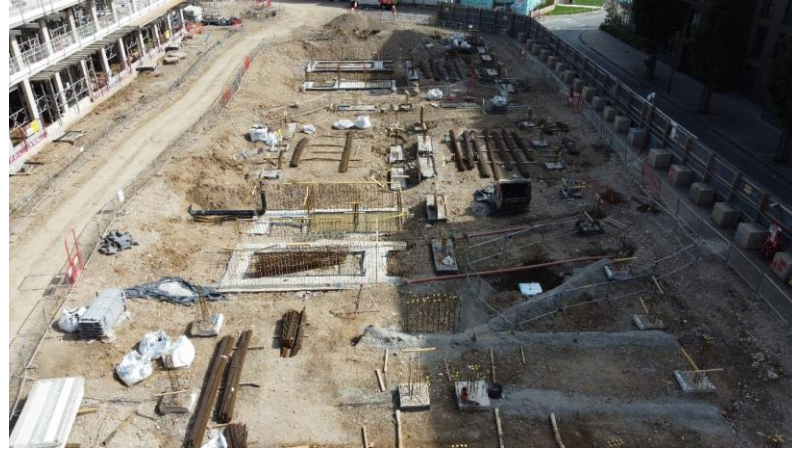
Ground work commencing to B4 & B5