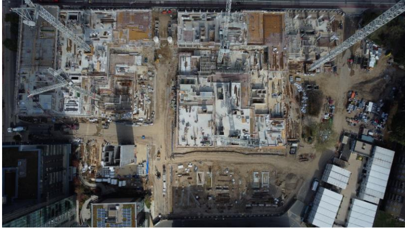
Concrete superstructure taking shape