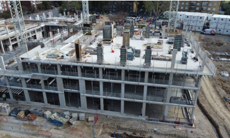
Concrete frame reaching third floor level