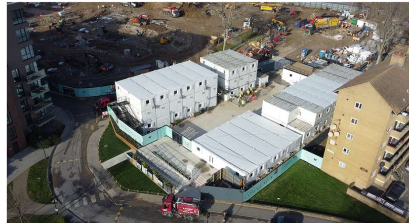
New site compound