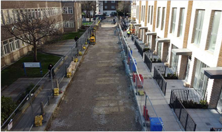
Spring Park Drive is being relayed