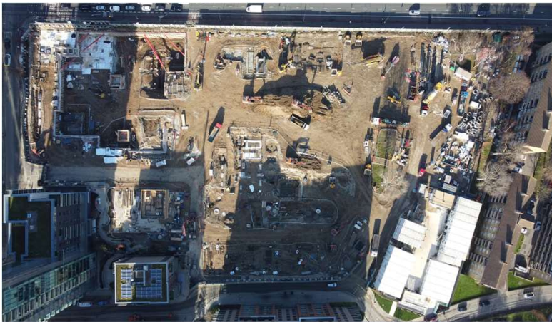
Piling work now complete