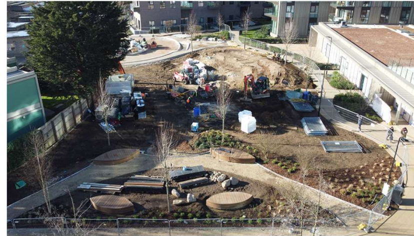
Landscaping on Spring Park is progressing