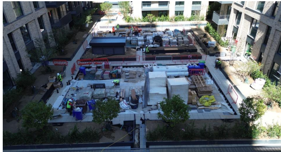
Block A Podium