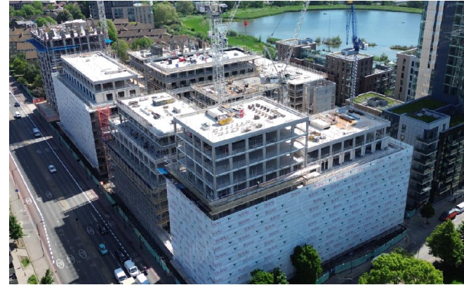
Concrete frame advancing