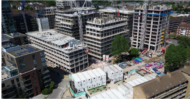
Concrete superstructure developing