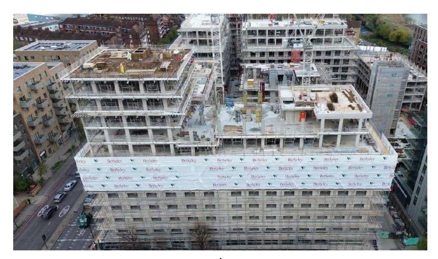
B1 (Dartar Apartments) roof level completed. Concrete frame reaching 9<sup>th</sup> floor level on the A Blocks