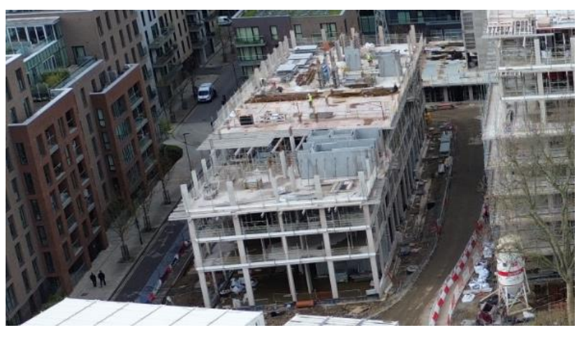
Concrete frame advancing on B4 & B5