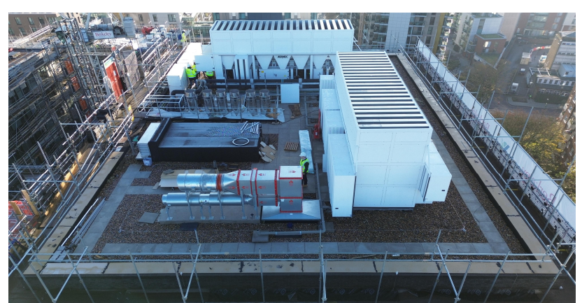
Air Source Heat Pumps