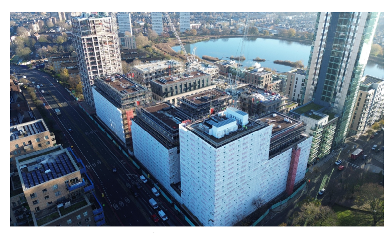
South East view