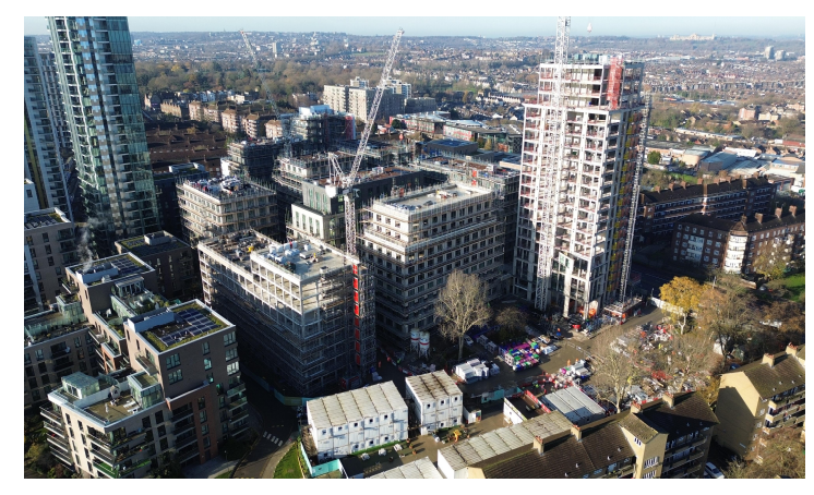
North West View